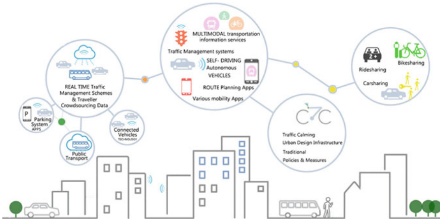
Fig. 1 Overall diagram of smart mobility tools, policies and services