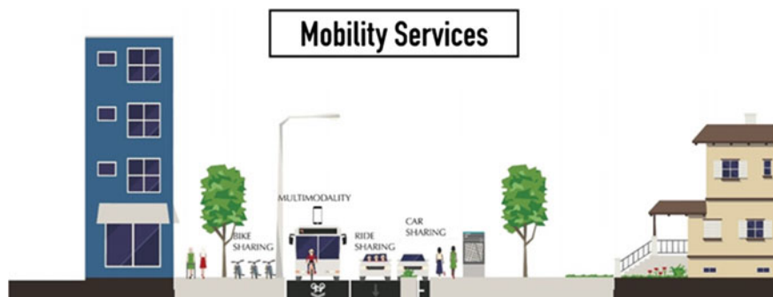
Fig. 3 Mobility services including ridesharing and multimodal management systems

Services generated in this new era of data acquisition and processing can significantly alter the way people choose to interact with their daily travels. Based on the new data availability and management, cities can develop dynamic tools to support reduction of traffic and carbon emissions; improve daily commuting pattern; decrease travel and maintenance costs; organize and sustain a viable on and off street parking system; impose fair congestion charging; and, most importantly, engage residents in urban and transportation management issues. Services may include congestion schemes, car sharing schemes, on demand car services, smart parking systems, real-time traffic control (see Fig. 3). Technologies allowing data collection from the wider environment (e.g. sensors or smartphones) can be used by local authorities to detect and solve problems, while complementary services can provide incentives to smart-users that decrease their environmental footprint and go multimodal. More common services deal with integrated public transport fare management or journey planning and travel assisting applications for improving individual travelers.