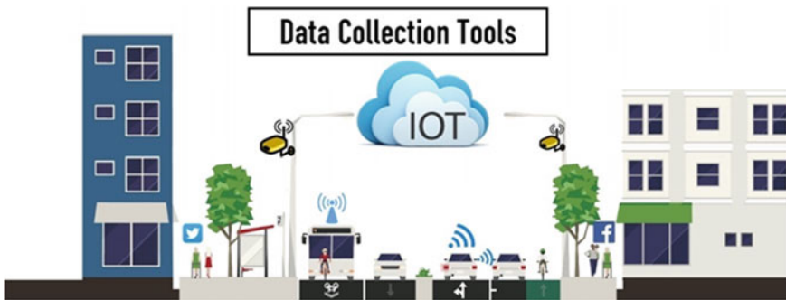
Fig. 2 Data collection tools including sensors, social networks, connected and autonomous vehicles

many services that highly rely on data gathering, crowdsourcing and technology to assist urban mobility alternatives. If the transportation related professions take full advantage of the technological and operational cutting-edge advances, traffic management can gain critical new tools to measure and understand commuting behavior and habits, leaving behind the traditional origin-destination and traffic volume studies. This can imply a highly promising professional revolution, embedding numerous changes in both the analysis and the policy formulation of sustainable mobility studies. The data can be gathered and provided either real-time or on demand according to the overall planning; and this can allow the flourishing of new types of services, letting the user of the transportation network become both the provider and the consumer of mobility information.